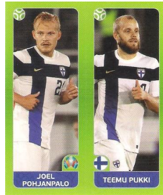
2'7 x 6'5